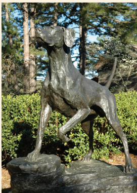
Field Trial Champion Elhew Snakefoot

outdoor recreation, environmental education, and conservation opportunities on the property. The Wehle family also established a charitable trust that provides support to the facility in perpetuity.